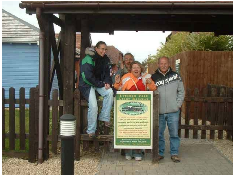
EVESHAM -SUNDAY 19TH OCTOBER 2008